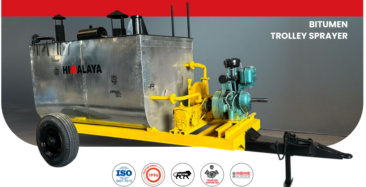
BITUMEN TROLLEY SPRAYER