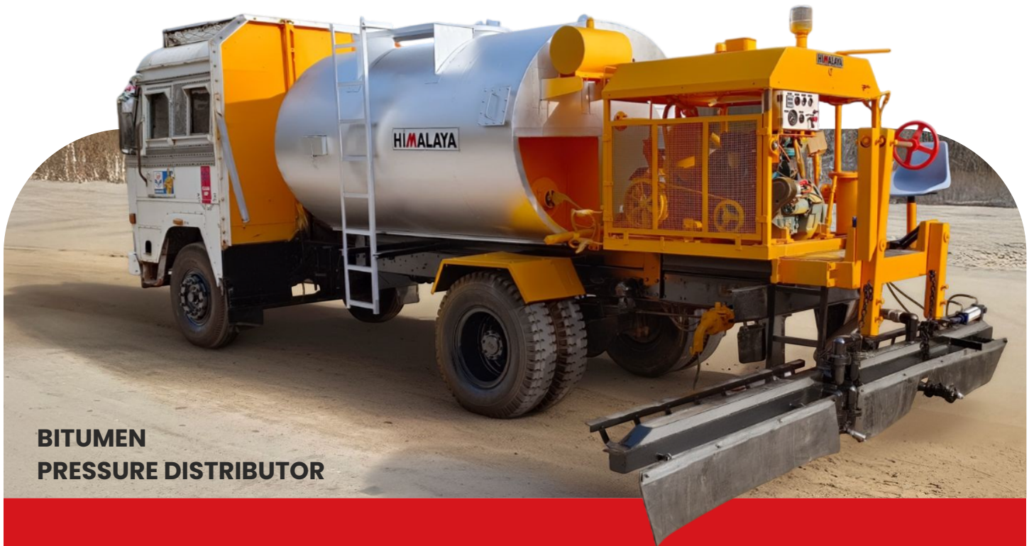
BITUMEN PRESSURE DISTRIBUTOR